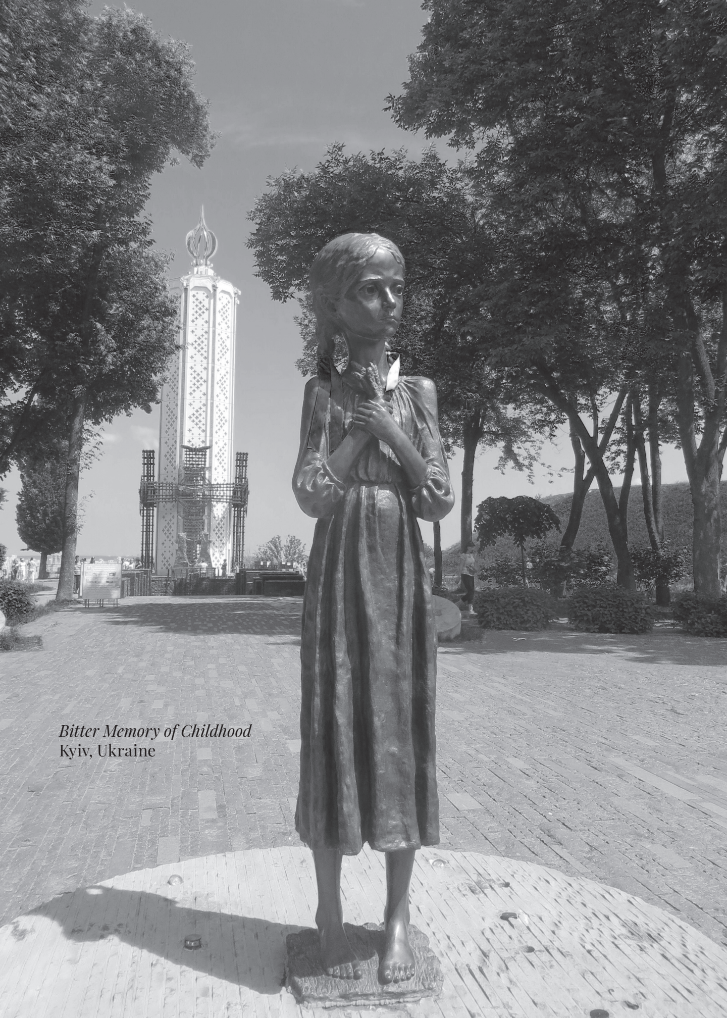
Bitter Memory of Childhood Kyiv, Ukraine